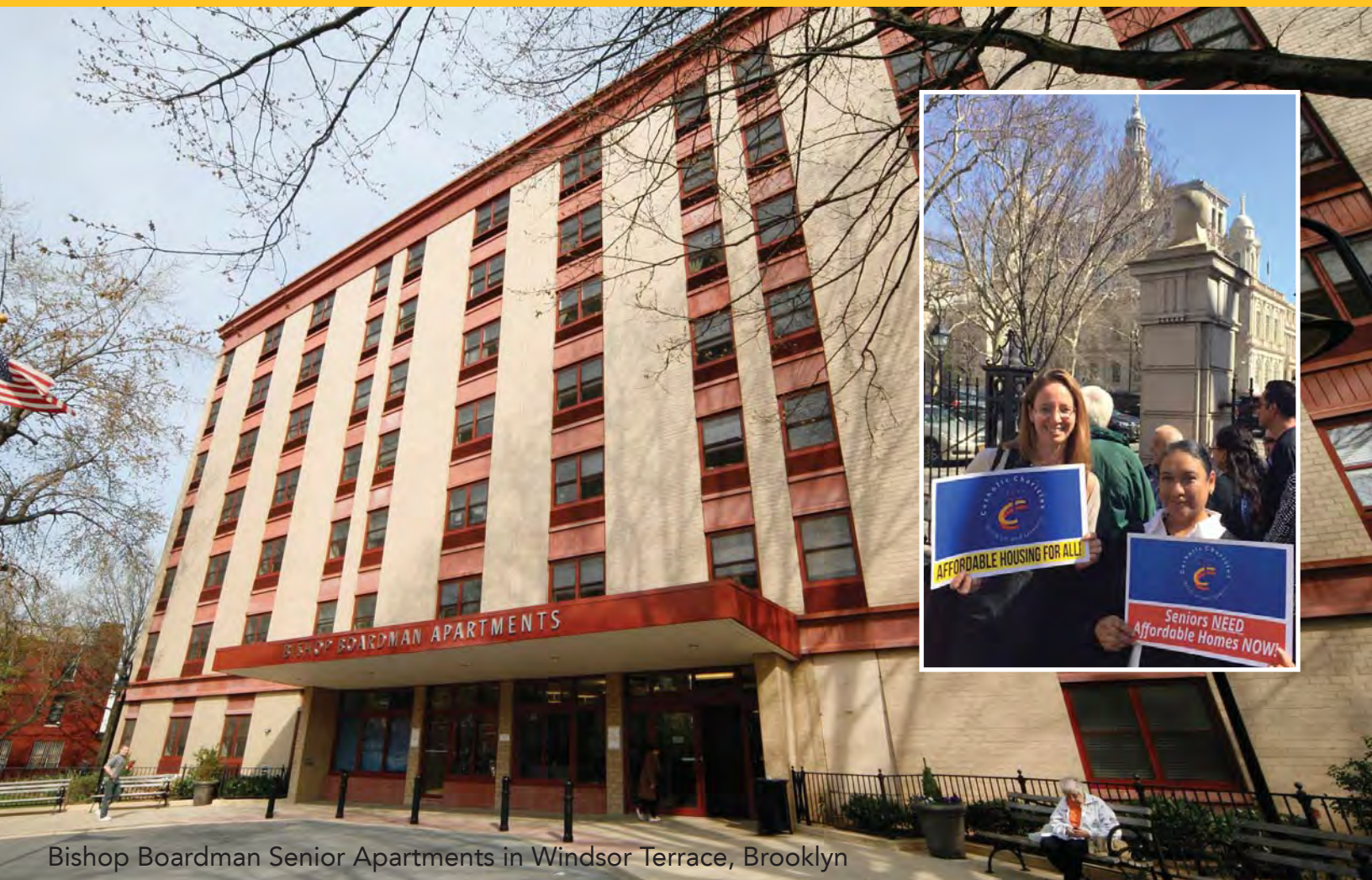
Bishop Boardman Senior Apartments in Windsor Terrace, Brooklyn